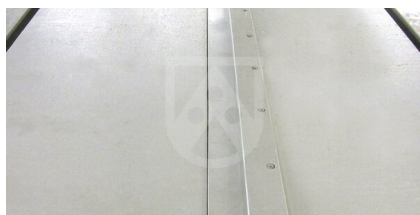
Polystone® P Flex