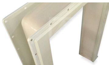
Polystone® P Flex